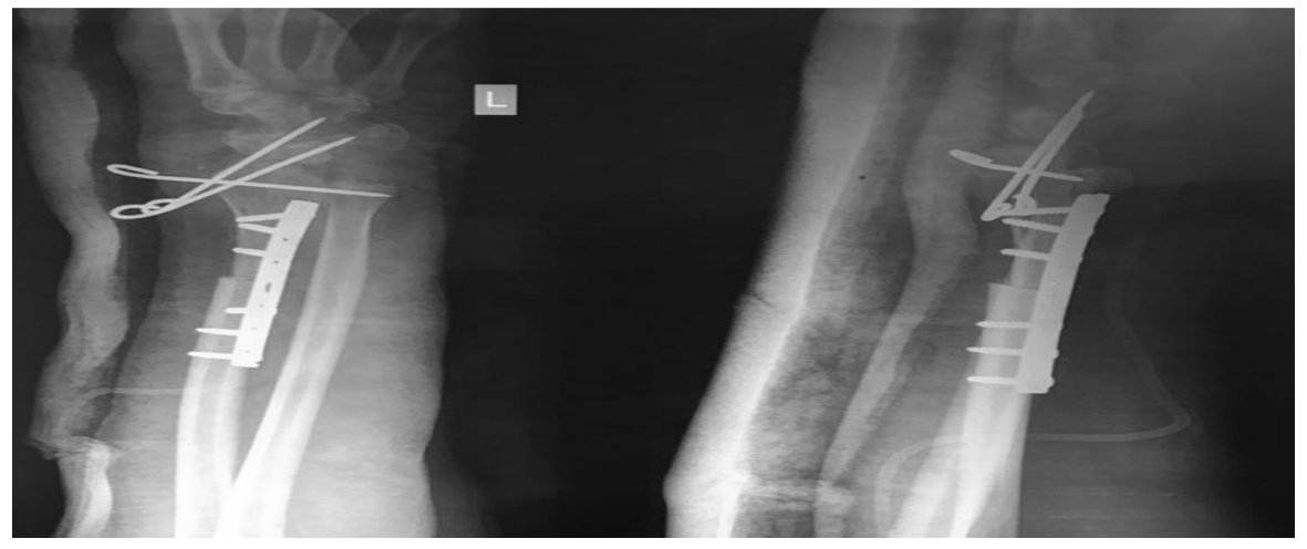
Figure 7 : Post Operative X-ray : Antereo Posterior and Lateral View Showing Distal Radius Reconstruction with Ipsilateral Proximal Fibula and Fixation with Mini DCP and also showing restoration and fixation of Distal Radio-Ulnar joint and Radio-Carpal Joints