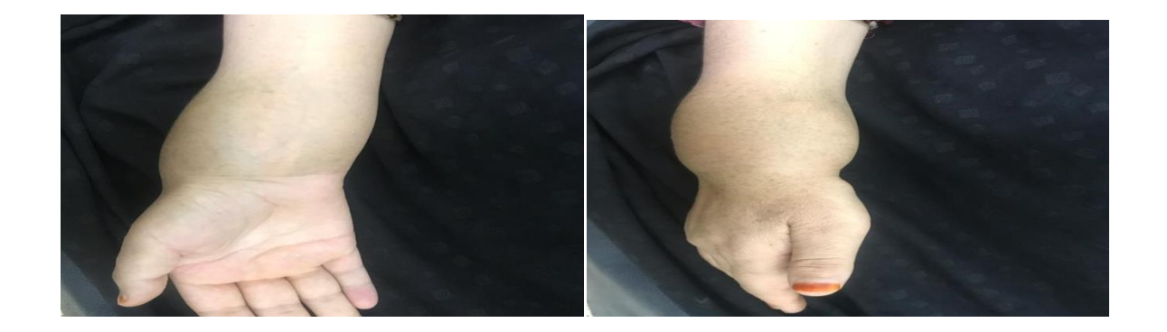
Figure 1 : Picture Of Right wrist showing swelling at distal radius level and Extension on vollar and dorsal side

which were successfully managed with broad spectrum antibiotics.